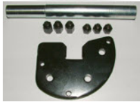
2¾" & 3" Case conversion kit for 600-350 12ga ONLY