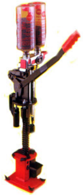
Clay&Game Reloaders MEC 600/Mark5 10ga STEEL

CGR/MEC 600Jr/Mk5-350 12ga is £246.00 plus delivery if needed £14.90. Or as 600Jr/Mk5-350EU 12ga with case length conversion kit for 2¾" & 3" cases £278.00 + £14.90.