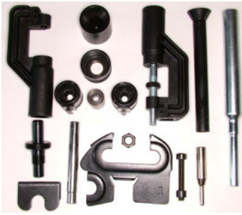
8452 MEC 600Jr/Mk5 .410 Die Set