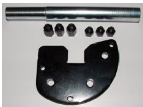
9165 Euro kit for 2¾" & 3" Case for a MEC 600 Mk5-350 £38.25 dc. £4.00